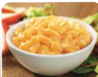
MAC IT YOURS