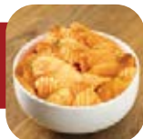
YUKON KETTLE CHIPS

Add additional sides for $1 more per person